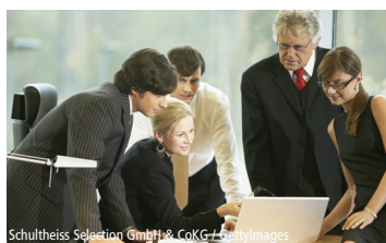
Schultheiss Selection GmbH & Co KG - Gettyimages

Register now at www.textile-technology.net